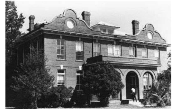
VOORHEES COLLEGE CAMPUS

Voorhees College Historic District includes the older portion of the campus and buildings dating from 1905 to the mid-1930s. The district is significant for its role as a pioneer in higher education for African Americans in the area and for its association with Elizabeth Evelyn Wright.